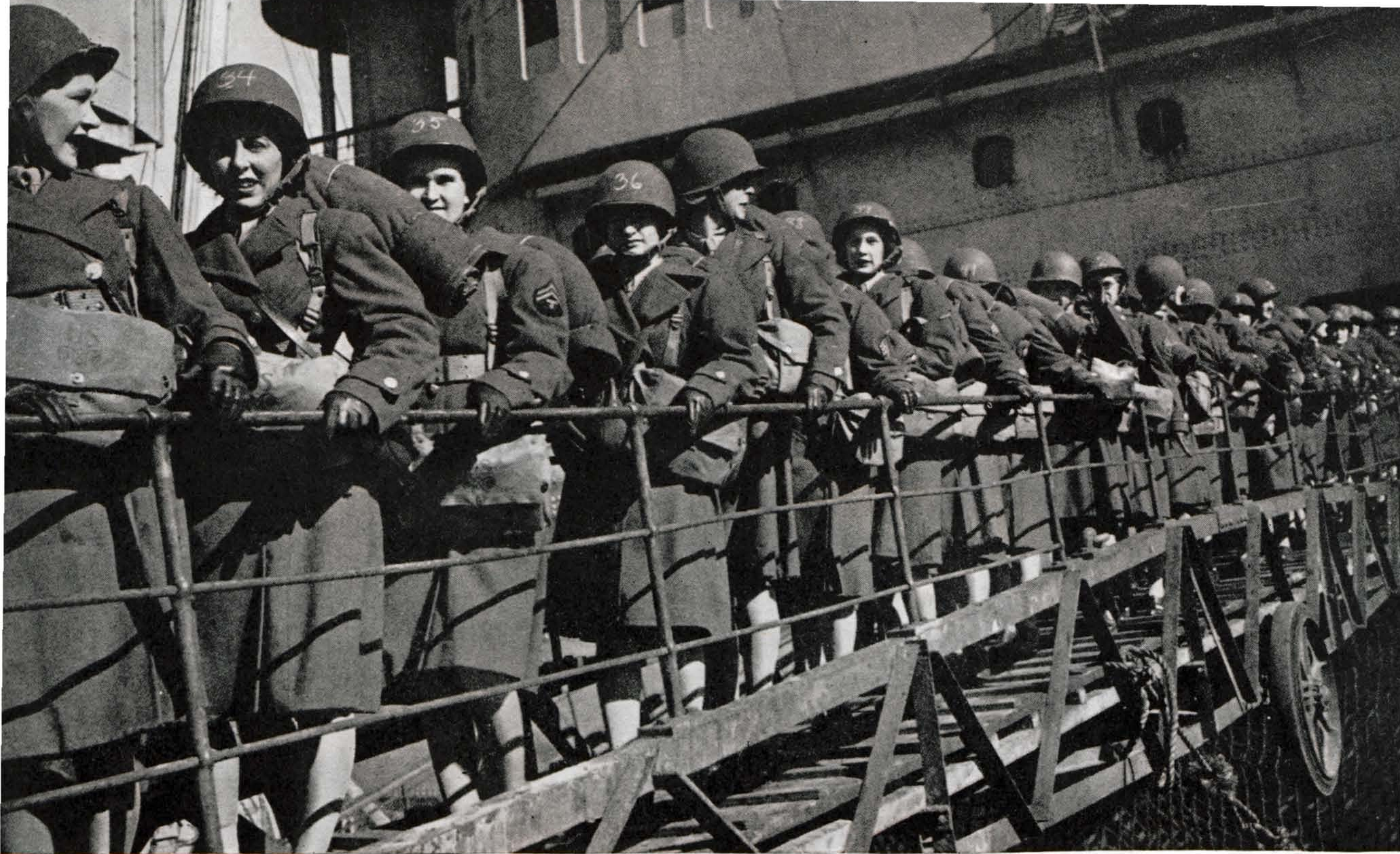
Wacs landing in North Africa. This is the only women's enlisted service permitted to go overseas. Total of all women in U. S. armed services at close of last year: Only 175,000.